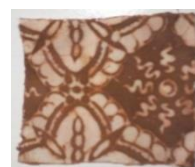
Figure 11. Results Removal Wax on Cloth with Tawas Fixer