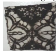
Figure 10. Results Removal Wax on Cloth with Tunjung Fixer

Candles attached to the cloth is removed by boiling the cloth in boiling water while It rubbed. At the temperature of the dye is only slightly soluble in water. Wax removal results can be seen in the following figure.