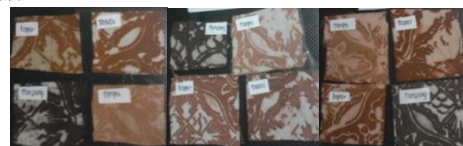
Figure 2. Results Solution dyeing extracts Mangrove, Tingi, and Indigofera with a 1:7 ratio (Sequentially from Left to Right).

On the material and solvent concentration variation in the ratio 1:7, the results obtained extracts and concentrated, with the following results: