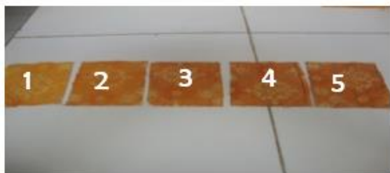
Figure 4. Results immersion with 1, 2, 3, 4, 5 grams of substance in 100ml Water Colors (Sequentially from Left to Right)

mordanted and given a wax batik motif with a cut to the size of 10 cm x 10 cm by 5 strands. Each cloth soaked in the dye solution with different concentrations for 15 min and then dried.