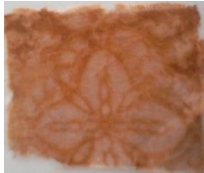
Figure 13. Results Removal Wax on Cloth Without Fixation

Part of the fabric removed white candle (corresponding primary color fabrics) because at the time of immersion dye cannot penetrate the wax layer. While the fabric will not be given a colored wax according to the dyes used and fixer solution.