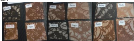
Figure 1. Results Extract Solvent Dyes, Mangrove, Tingi and Indigofera with 1:10 ratio (Sequentially from Left to Right)

Variation of the concentration ratio of raw material and solvent is 1:10, 1:7, and 1:5. At 1:10 comparative results obtained liquid extract and concentrated, with the following results: