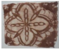
Figure 12. Results Removal Wax on Cloth with Lime Fixer