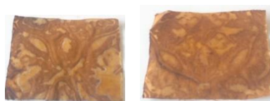
Figure 8. TawasFigure 9. Without Fixation

From the figure above it can be seen that the fixation with a solution lotus effect older, younger limestone effect, and alum gives a moderate effect on the color (as the original color).