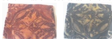
Figure 6. Tunjung Figure 7. Lime

In this experiment, the fabric has been given a motif and cut to a size of 10 cm x 10 cm by 4 pieces, then dipped in a dye solution concentration of 4 ml gram/100 5 times) which is 1 times the dyeing is done for 15 minutes, followed by drying, and newly dyed again. Then fixed with cloth fixer solution is different lotus or \text{FeSO}_4 solution, lime, alum, and one piece of cloth is not fixed and used as a comparison. Fixation results as follows: