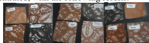
Figure 3. Results Extract Solvent Dyes, Mangrove, Tingi and Indigofera with a 1:5 ratio (Sequentially from Left to Right)

At the 1:5 ratio results obtained extracts and concentrated, with the following results: